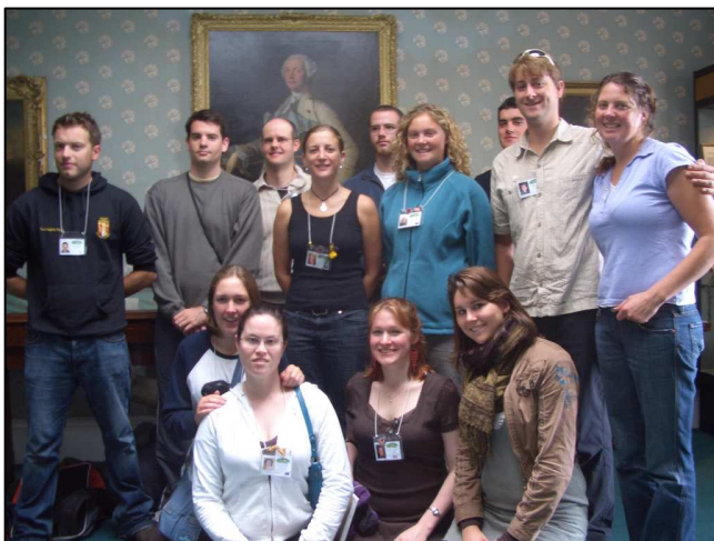
The NRG – in the North Room – in 2006

passes next to the Scaladale Centre. The NRG were housed at the Scaladale Centre during the project. While there, they hosted a morning tea for the participants in the pre-Parliament trip to Lewis and Harris, and participated in other Parliament events in the outer islands and later in Dunvegan.