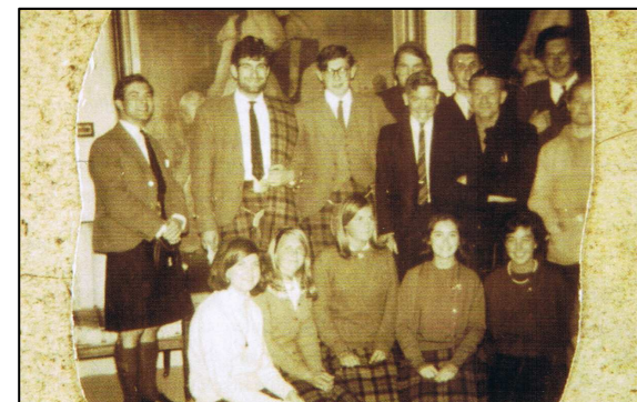
The first NRG, in 1965

The NRG continues to be encouraged to involve itself in the mainstream activities of the Clan. Over time, many of our Clan leaders have participated in NRG when they were young. While having their own identity, they are considered an integral part of Parliament. Beginning in the 1990s, NRG has taken on service projects for the Castle estate and for Parliament itself. There is additional information about the history of NRG on the ACMS website at http://www.clanmacleod.org/ , under the Youth Section.