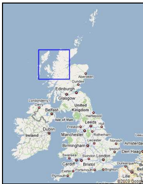
Area outlined in the map of Britain and Ireland (at right) shows context of larger Parliament map (below).